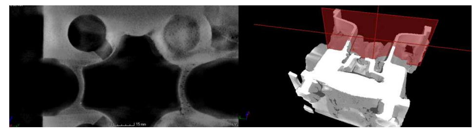
Figure 3: Imaging porosity in a casting

Some examples are shown here which demonstrate the power of the technology for imaging of a crack in a mechanical winding lever (Figure 1) and a cracked Jaguar CV Joint (Figure 2). An example of porosity imaging in a casting is shown in Figure 3. The slice is shown to the left, with the corresponding slice plane shown in red in the 3D view to the right.