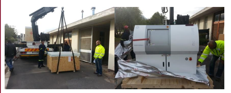
The first and only nanoCT in Africa

The first nanoCT in Africa was delivered this month, two months ahead of schedule, well done to our suppliers! This instrument is able to scan small samples at resolutions down to 500 nm voxel size (per 3d pixel), and includes in-situ cells for sample temperature control and sample compression. The instrument is currently being commissioned and the official launch function will be on 15 September 2014 in combination with academic workshops, more details will follow. All our clients are welcome attend. All to support is gratefully acknowledged.