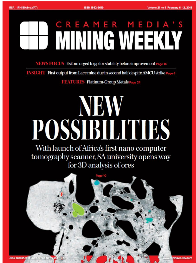
Figure 2: Cover page of Mining Weekly, full article here:

http://blogs.sun.ac.za/ctscanner/files/2013/07/53203_mining_weekly_6_february_2015.pdf