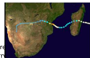
Tracking path - cyclone Eline, 2000

The 2002 Cyclone Eline remains the most devastating sudden-onset