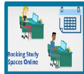
Booking Study Spaces Online

Library staff have been working hard throughout 2020 and into 2021 to make sure that you have access to the Library resources and services you need to support your studies. We've introduced online booking for Study Spaces in the Library and in other locations on campus and in the city, and ensured that these spaces are socially distanced and COVID-safe.