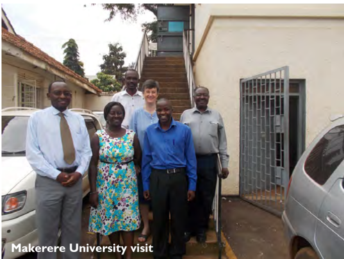
Makerere University visit