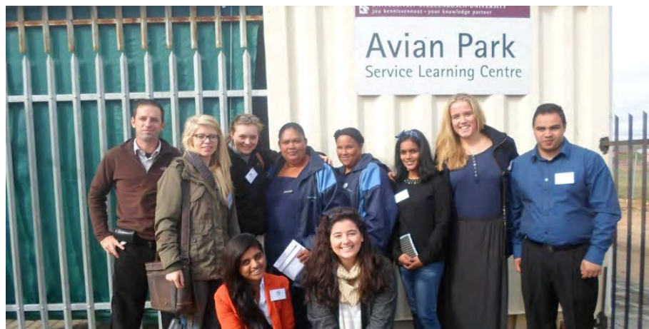
Facilitators with students at Avian Park