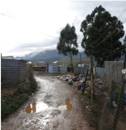
1st year medical students in rural areas