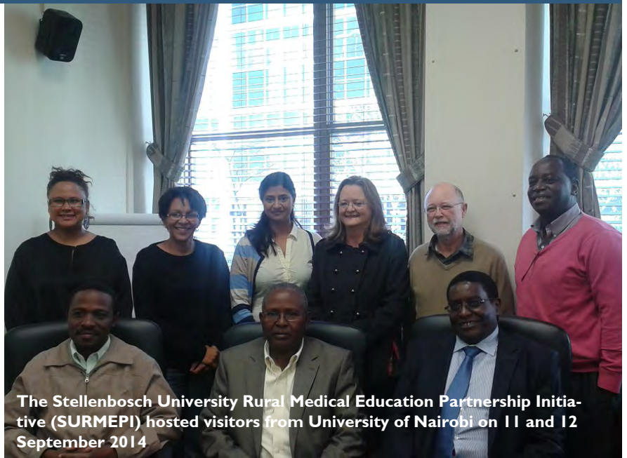
The Stellenbosch University Rural Medical Education Partnership Initiative (SURMEPI) hosted visitors from University of Nairobi on 11 and 12 September 2014