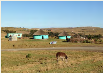
Rural Eastern Cape

The programme uses the PACK (Practical Approach to Care Kit), a comprehensive, policy aligned Primary Care guideline for adults which addresses the 40 most common presenting symptoms and 20 chronic conditions in adults attending primary care in South Africa. PACK training consists of 4 modules namely, HAST, non-communicable diseases, mental health and woman's health.