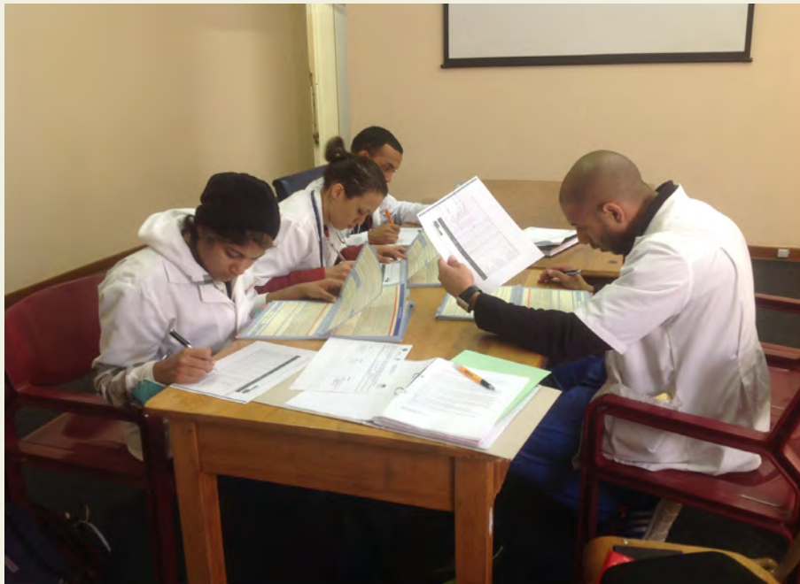
Medical students at PE using guidelines.

There are two main aims to the programme: