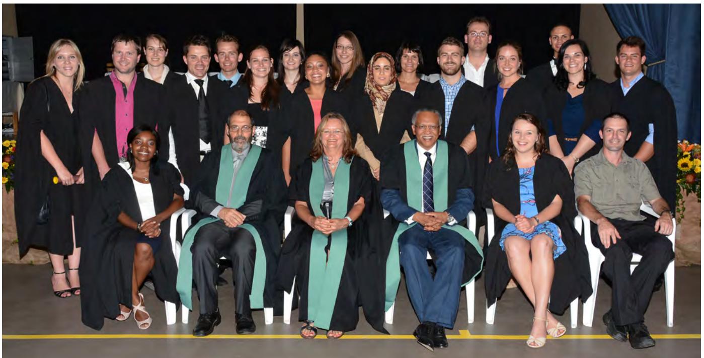
2013 RCS student graduation