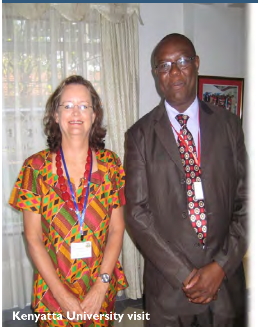
Kenyatta University visit