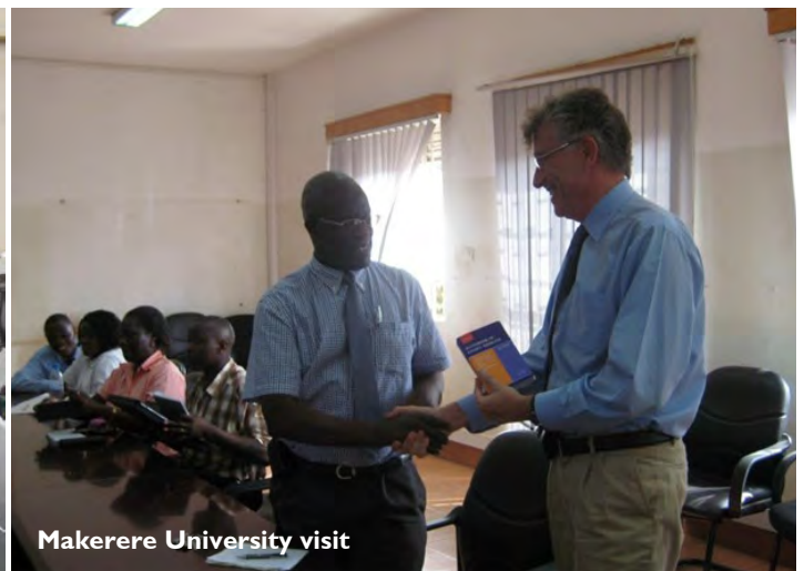
Makerere University visit