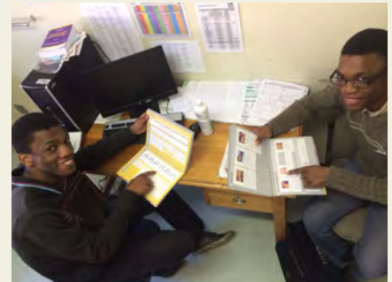
Medical students at Zitulele using guidelines.

The results will be analyzed at the end of the year and if the findings are positive, it will be used to motivate for this programme to become a permanent part of the medical curriculum. The results from this trial will also influence how the guideline is included into other medical schools in South Africa. If you would like more information about PACK please visit our website: www.knowledgetranslation.co.za