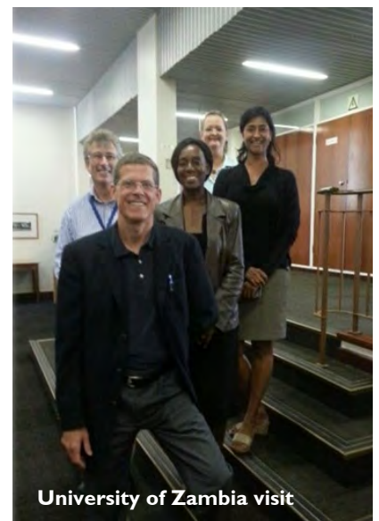
University of Zambia visit