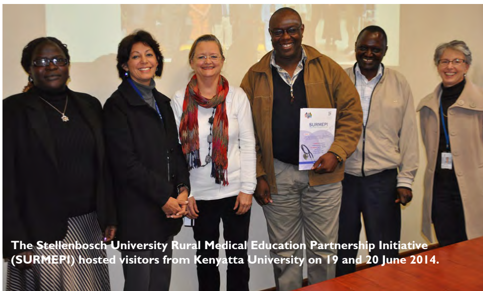
The Stellenbosch University Rural Medical Education Partnership Initiative (SURMEPI) hosted visitors from Kenyatta University on 19 and 20 June 2014.